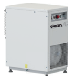
CLR 15/30 CLR 20/30