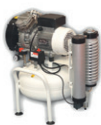
CLR 15/25 CLR 20/25