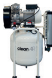
CLR 15/50 CLR 20/50 CLR 25/50